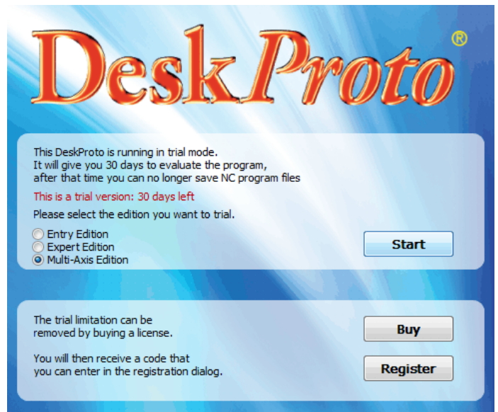
The three editions, in the new Trial screen