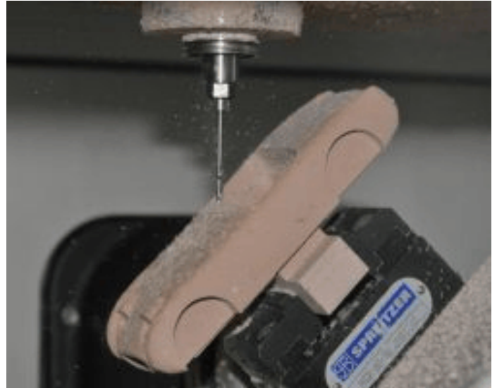
Five-axis machining a scale model using the DeskProto CAM software.

A special 20% introduction discount on Upgrades is offered in December 2011 and January 2012 ! On the commercial upgrade V4.2 > V6 Multi-Axis even 33 %. As all V4.2 hobby licenses have been purchased after May 1 st , all will receive a free upgrade. All prices are in Euro, and excl. VAT.